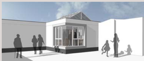
Sun Room Extension to St Mary's Care Home, Monifieth

JFSA were delighted to be invited to participate as "Executive Architects" in the V & A project to work alongside prizewinning designer, Japanese Architect Kengo Kuma. Joining this team is quite an accolade for the Practice and testimony to the high quality skills, experience and efforts of all our Partners and staff upon which our respected reputation has been built. This project is well underway and on programme for completion in 2018. We currently have a variety of other projects on site including the five bedroom and sun room extension to St Mary's Care Home in Monifieth for the Diocese of Dunkeld.