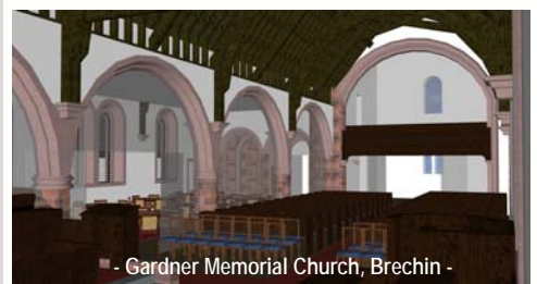
- Gardner Memorial Church, Brechin -

The Practice recently obtained "Change of Use" consent for 14 The Chanonry, Aberdeen for the Diocese of Aberdeen where they are about to re-locate their Diocesan Centre. The proposed Link & Hall Extension at Lowson Memorial Church, Forfar has also received planning and listed building approval. In addition projects which are also progressing forward having recently received funding via the Heritage Lottery Fund include: a self catering facility at Cultybraggan Army Camp, Comrie and the 'A' Listed Gardner Memorial Church, Brechin.