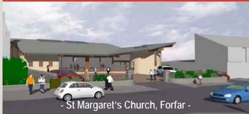
- St Margaret's Church, Forfar -

A proposed New Centre for St. Margaret's Church, Forfar is in development; a refurbishment to the restaurant and services at The Horn Milk Bar, Errol, Perthshire is 'on the drawing board'; and an extension for AG Barr, West High Street, Forfar is at 'discussion of the brief' stage.