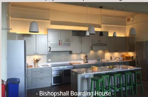
- Bishopshall Boarding House -

The £1.67Million refurbishment project at the High Mill & Preparing Rooms, Verdant Works, Dundee is complete with the project a 'Winner' in the 2016 RIAS/Historic Environment Scotland Conservation & Climate Change Awards. Also complete are two residential developments for Stirling Council at Wallace Crescent, Pleian and Thornhill, Stirlingshire and alterations to cottages at Simprim Farm, Meikle are complete. Our refurbishment project at Bishopshall Boarding House for