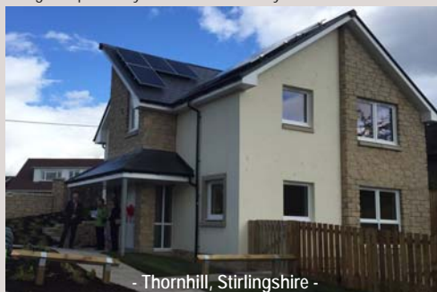
- Thornhill, Stirlingshire -

St Leonard's School, St Andrews was also recently handed over. The project involved repairs/restoration of the external building fabric and internal refurbishment and reconfiguration. This provides additional rooms/bed spaces, new services throughout and improved accommodation with a contemporary feel. The upper floors and communal areas were all completed in time for the start of the academic year, with the final works being completed by the October holidays.